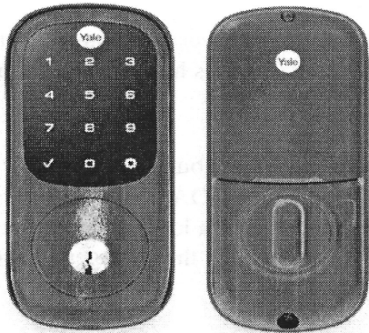
Yale Assure Lock - Touchscreen Keypad Door Lock in Bronze